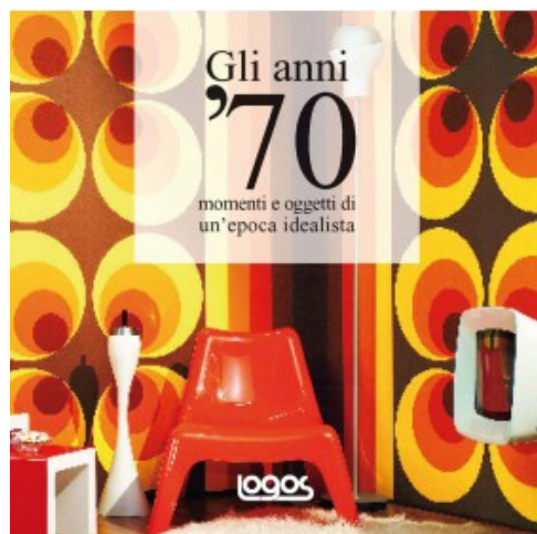
GLI ANNI '70