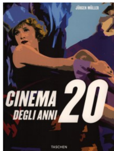
CINEMA DEGLI ANNI '20