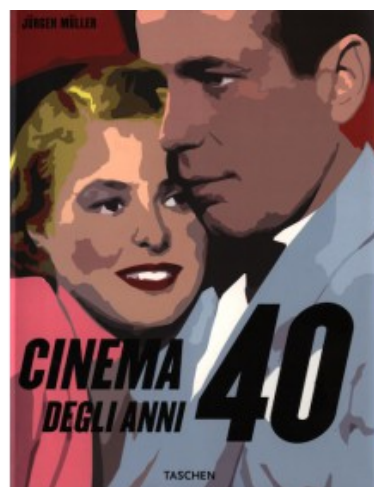
CINEMA DEGLI ANNI '40