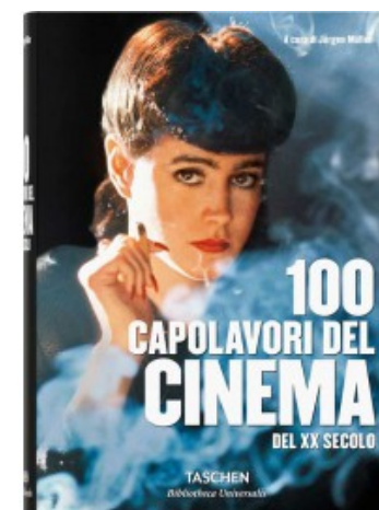
100 CAPOLAVORI DEL CINEMA DEL XX SECOLO