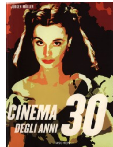
CINEMA DEGLI ANNI '30