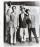
Norman Rockwell and Thomas Hart Benton standing in front of the New York Public Library.