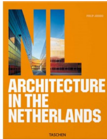
ARCHITECTURE IN THE NETHERLANDS (IEP)