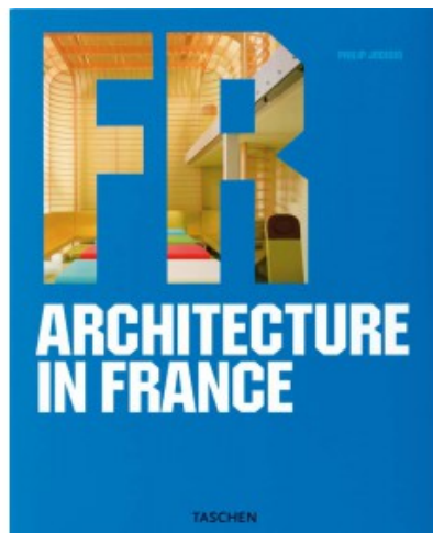
ARCHITECTURE IN FRANCE (IEP)