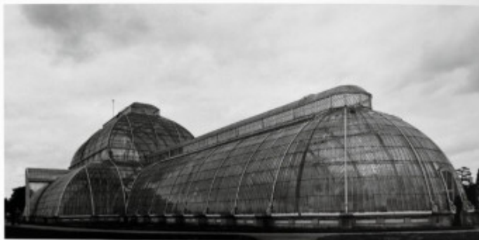
Decimus Burton and Richard Turner Palm House in the Royal Botanical Gardens in Kew/Surrey, England, 1844-1848 View from the south-west

The exotic plants of the Royal Botanical Gardens were housed within a miracle of iron and glass 110 metres in length. Twelve boilers supplied warm water for the heating pipes and guaranteed an indoor temperature of 27 degrees even in winter. Rain water was channelled to an underground reservoir via hollow cast-iron pillars and collecting pipes in the stone base. A spoil car for transporting coal, the smoke outlet and the lead pipes for the sprinkler system were housed in a tunnel, which surfaced into a smokestack and comparable style water tower of a visually acceptable distance.