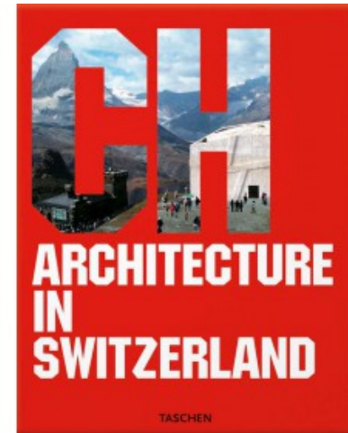
ARCHITECTURE IN SWITZERLAND (IEP)