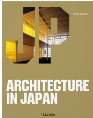
ARCHITECTURE IN JAPAN (IEP)