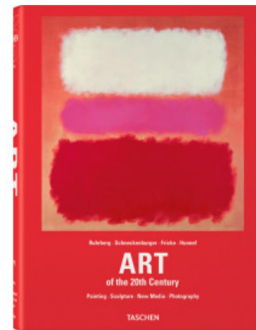
ART OF THE 20TH CENTURY - FP