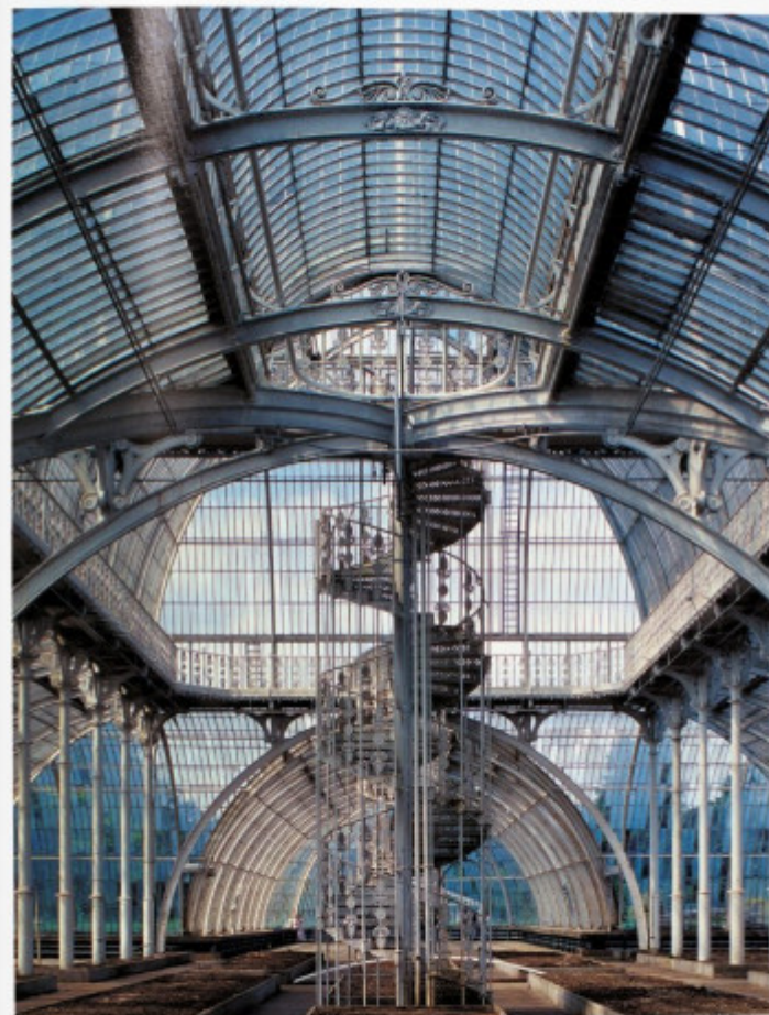
Opposite page: Interior view This photograph was taken before the start of restoration in 1985, while the Palm House was entirely empty.

Exhibition halls had other specifications and design criteria. Emphasis lay not